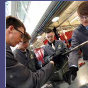
T Levels Level 3