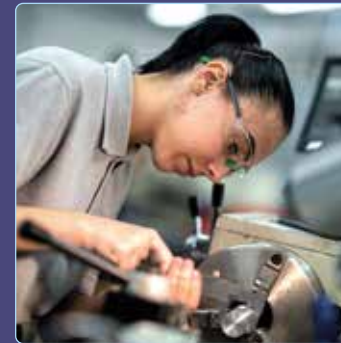
Performing Engineering Operations (PEO) Level 2

Upon enrolment, students will receive advice and guidance on each of the pathways to make an informed choice as to which pathway best suits their future career.