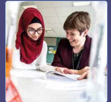
A Level / BTECs Level 3

“On a weekly basis I would be working directly with employers at UTC. This experience allowed me to network with employers and gave me a head start in getting an apprenticeship.”